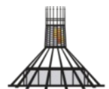
Metropolitan Cathedral of Christ the King Liverpool

We are holding 'Be a Chorister for a Day' events for BOYS on Sunday 18 June and GIRLS on Sunday 25 June, 10.30 am – 4.00 pm. Come and find out more about being a chorister and have fun playing, singing, eating and exploring. Application forms and further information are available on the Cathedral website or by contacting the music office: music@metcathedral.org.uk or 0151 708 7283. Places are limited on a first come, first served basis.